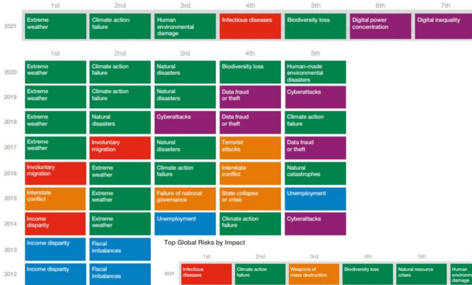
Top Global Risks by Impact